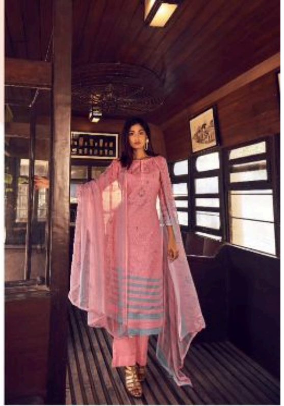
Shawl and trousers (shown) as well as the trousers (shown) are available in the same color as the trousers (shown)